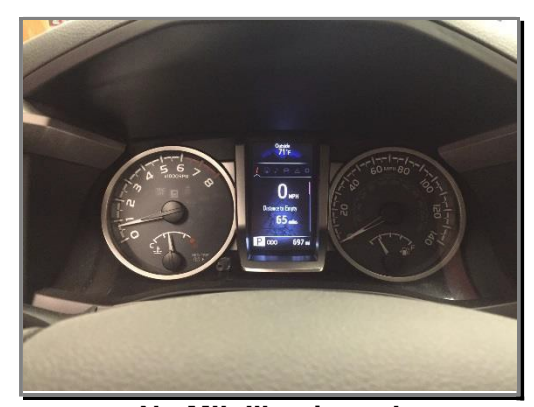
No MIL Illuminated

Considering the fact that a capable scan tool is the only way to identify some DTCs, Toyota requires that repairers perform a "Health Check" diagnostic scan if a vehicle has sustained damage as a result of a collision that may affect electrical systems. Additionally, Toyota strongly recommends that repairers perform a "Health Check" diagnostic scan before and after every repair to identify and document DTCs. If DTCs are identified pre-repair, then they can be considered to create a complete vehicle damage analysis report. If DTCs are identified post-repair, then they can be diagnosed and addressed before returning a vehicle to the customer.